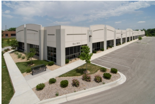
(ENTRANCE TO OFFICE BUILDING)