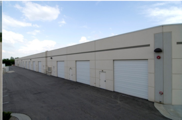
(DRIVE IN DOORS ALLOW EASY ACCESS )